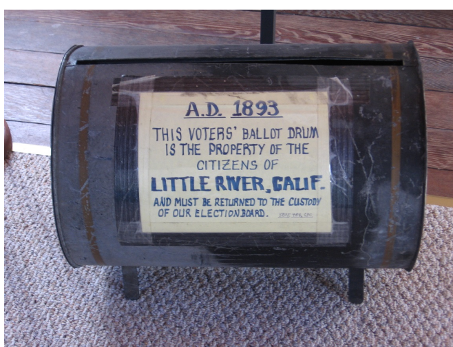
The Good Templars building was left to the organization's women who purchased it for $1 and renamed it the Little River Improvement Club. The citizens of Little River cast their ballots here for 100 years.

The building was built to the Golden Mean as a meeting hall for the International Order of Good Templars. We hope you'll visit when you see our sign out again next summer. The Hall is also open by appointment and available for small meetings or weddings. 707-937-2014 or LRIC@mcn.org